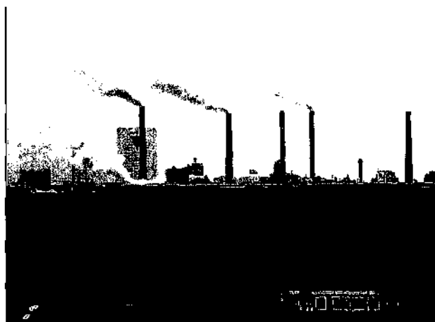
Figure 1. View on the plant before implementation of resource-conserving technologies

Before the beginning of the reconstruction the open-hearth furnace was located in the central part of the city and characterized by the large emission of harmful substances (dust, oxides) in the atmosphere. Present at the enterprise system the open-hearth furnaces gas purification were not equipped. In 2008 emission of the enterprise were 8.4 % from a metropolitan index on emission from stationary sources.