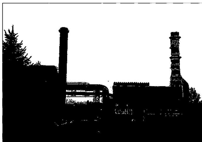
Figure 2. View on the plant after implementation of resource-conserving technologies

Electric furnace steelmaking, due to high-efficiency gas purification systems is ecologically safe. During the work of electric furnace workshop from gas purification buildings by sight emission are not observed, and indexes of emission on an order below what at the open-hearth method of production became.