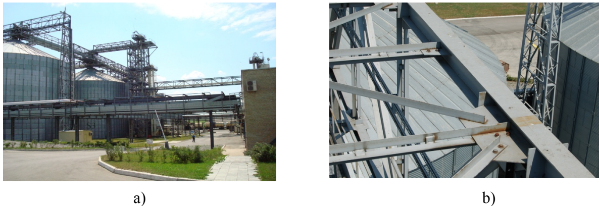
Figure 3 – Corrosion state for bearing steel structures.